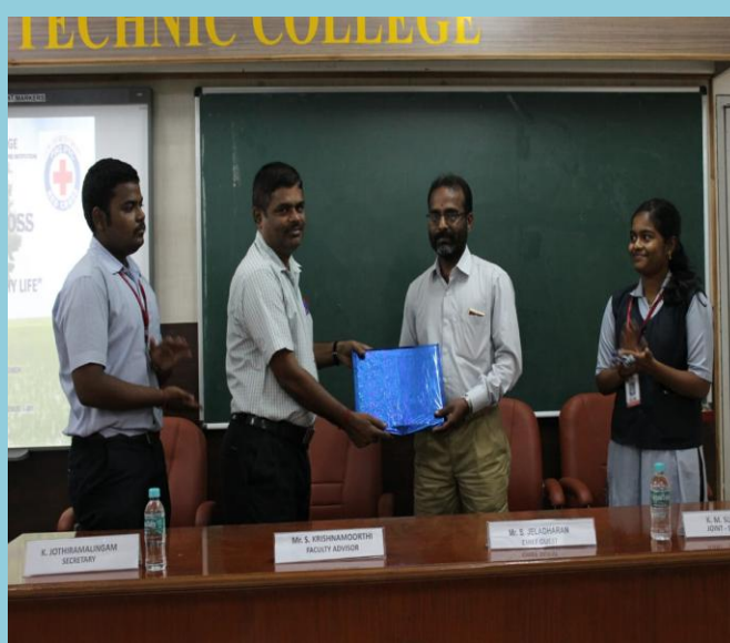
Momento to chief guest by Faculty advisor