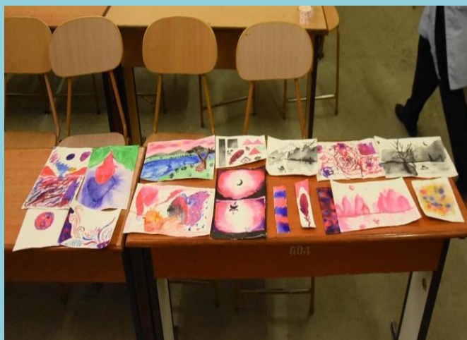
Creativity by ink wash

Youth Red Cross has conducted two programmes. Event - Mime acting mono colour pick on POLYFEST – 2018 and workshop on human health and hygiene to help enlighten the people on the importance of hygiene and its positive impact on us.