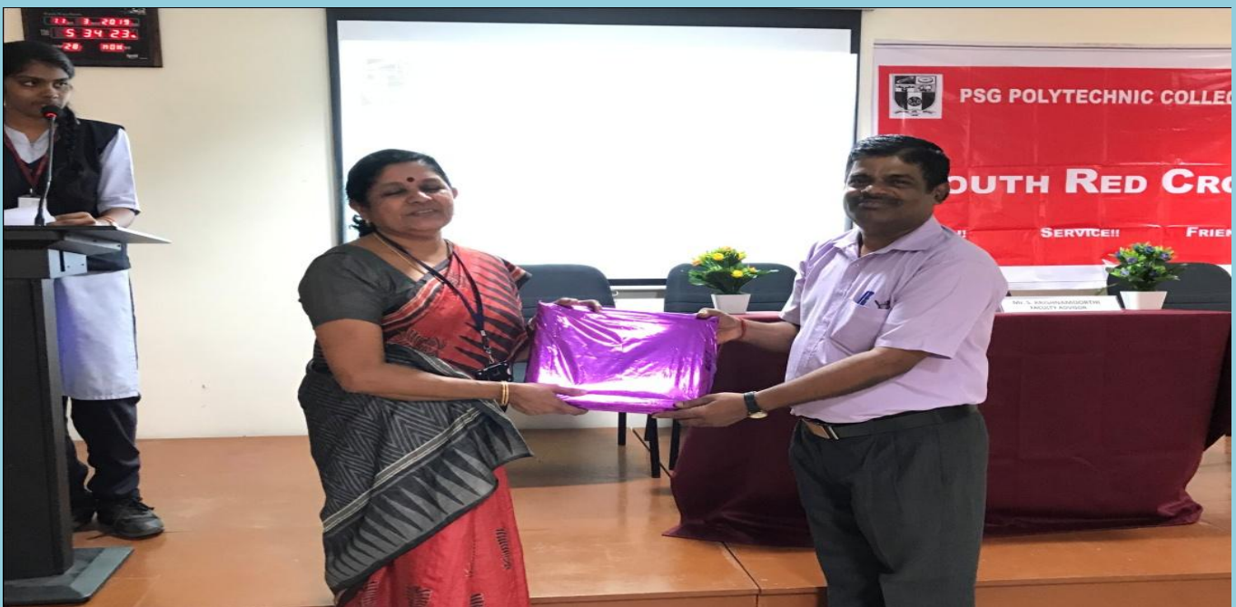
Memento to chief guest by Faculty advisor