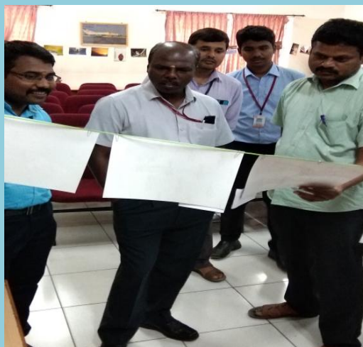
Photo Exhibition was conducted. 25 Students submitted their best Photographs. About 120 photos were displayed.