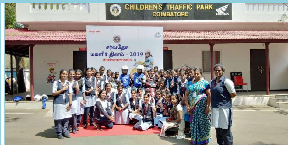
Our College RSP, NCC, Rangers and Rovers and WDC of 50 girl's students Participated in this event and won many prize

IIF Students Chapter conducted 3 programmes.