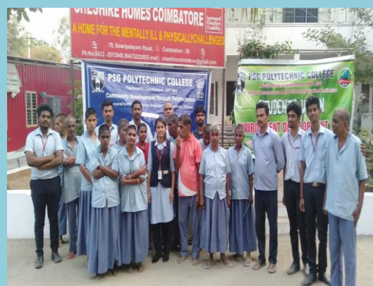
Planting saplings in Cheshire Homes

Title of the event : Mushroom Cultivation