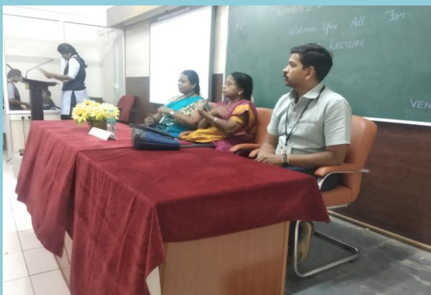
WDC Secretary welcomes the chief guest