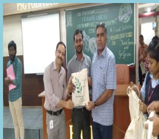
Distribution of ECO bags

Title of the event : Visit to Cheshire Homes