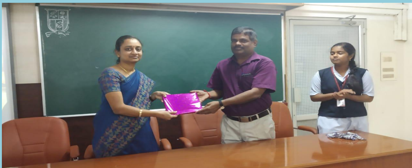
Momento to chief guest by Faculty advisor