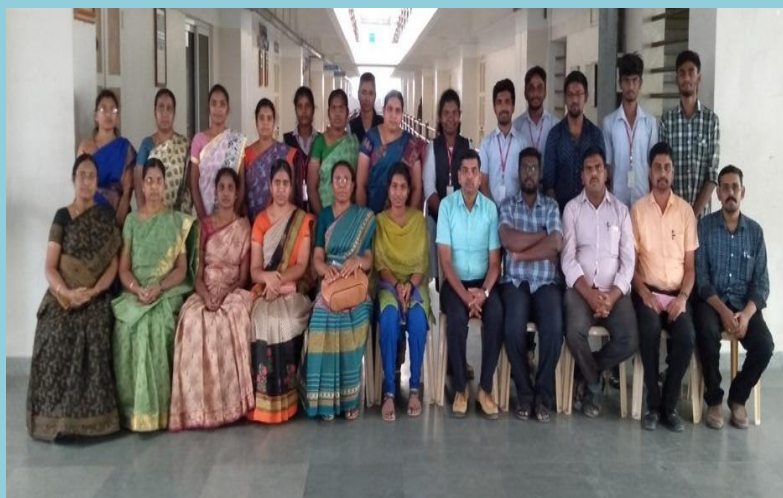
Group photo with participants

CEC has also organized a short term programme on “Parametric Design using CATIA V5 - 6 R17 from 12.2.2019 to 15.3.2019 with 13 participants by the department of Mechanical Engineering.