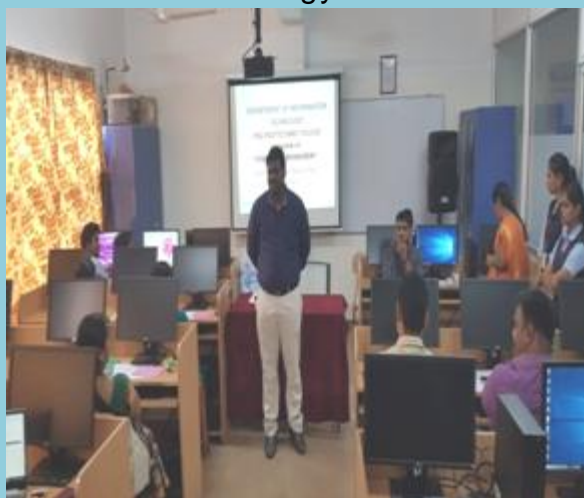
Session by Resource person

CEC has organized “State Level workshop on Mobile Computing using Android” for the faculty of various Polytechnic Colleges on 1 st & 2 nd Feb 2019 with 23 participants by the department of Information Technology.