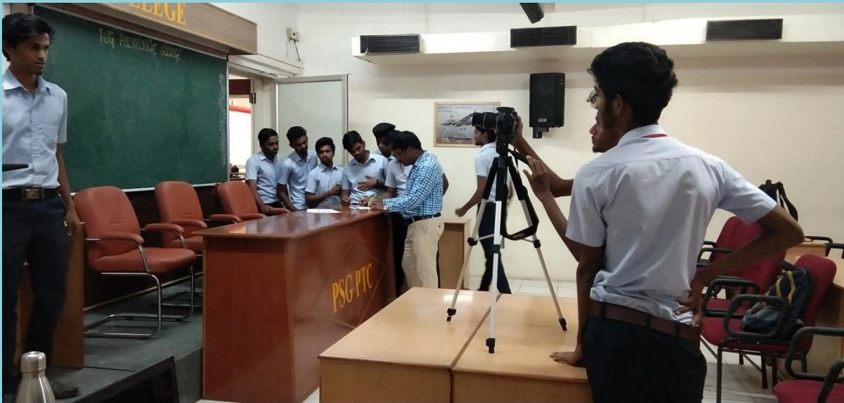
Photo session for first year students