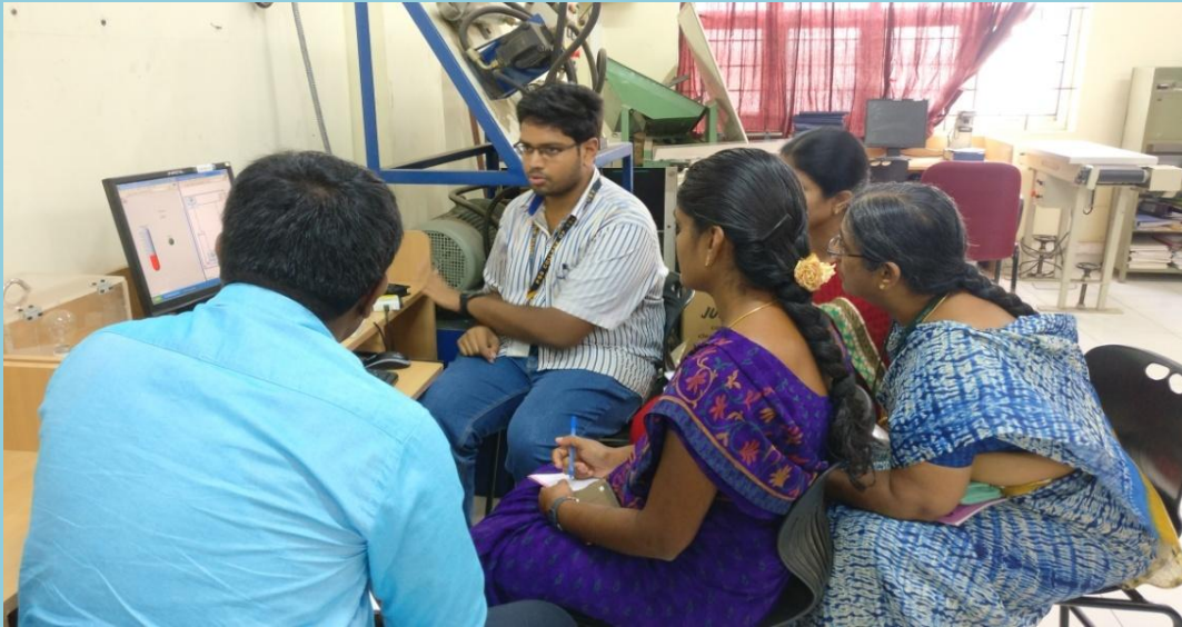
Hands on training in LAB VIEW

Assistant Professor, Department of Mechanical Engineering, PSG College of Technology was the resource person about 25 members had participated.