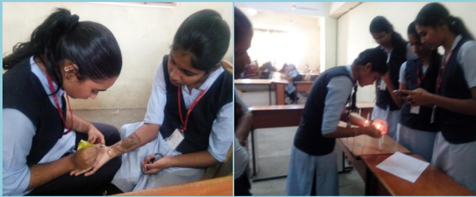
Mehandi and Candle lighting competition