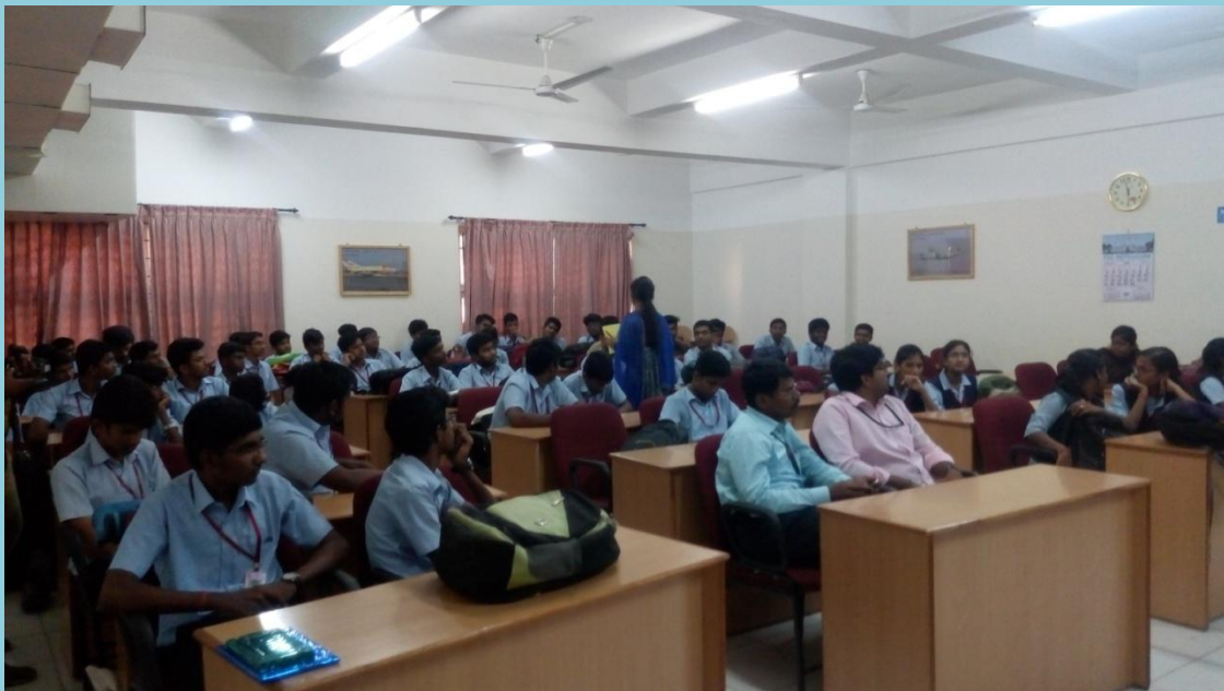
Speak up speak out Programm

CAP Club has conducted 6 programmes in the following topics. Advertising Contest, Speak up speak out, Shuffle the word, Situation management, guess the personality and stress interview. About 80 students participated in the guest lecture. Advertising contest was organized and about 78 students participated in the above event.