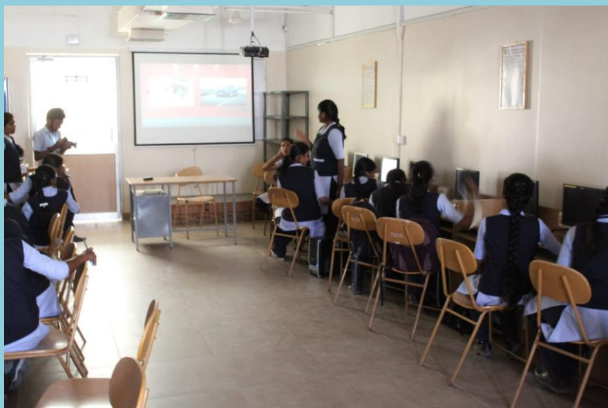
WDC Student secretary organizing the event