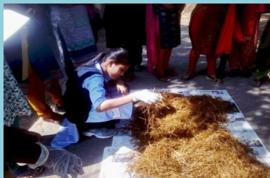
Mushroom Cultivation and Practical session